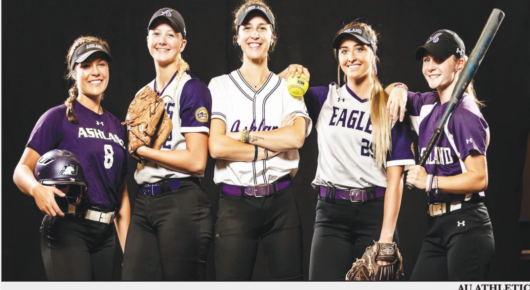
Members of the softball team pictured above.