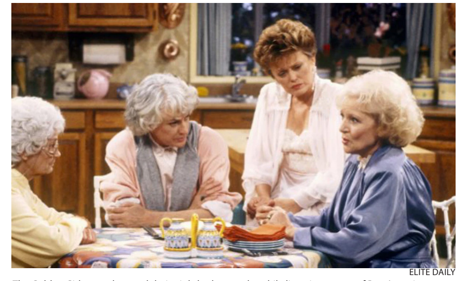
The Golden Girls crowd around their nightly cheesecake while listening to one of Rose's stories.

So picture it: America, 2019. There's a warmth in the air and getting along is a little easier. Well, it's a lot easier with cheesecake.