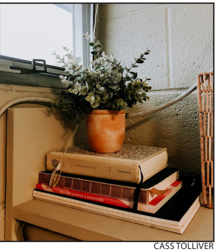
Indoor plants can help dorms feel cozier.

Having something green and alive in your dorm will bring life to it. Indoor plants have been proven to boost your mood, productivity, concentration and creativity. They also reduce stress levels, fatigue, sore throats and colds. Along with helping human immune systems, plants clean indoor air by absorbing toxins, increasing humidity and producing oxygen. They also help add life to sterile and bland environments, give a sense of privacy and reduce noise levels. As long as you water it appropriately, your plant will change your dorm room for the better.