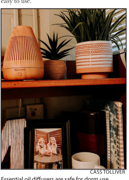
Essential oil diffusers are safe for dorm use.

There are numerous benefits to having an essential oil diffuser in your room. It can relieve stress, improve sleep, kill off bacteria and mold, help with appetite control and decongestion, as well as pain relief. Along with those benefits, oil diffusers have safe scents. Unlike air fresheners, essential oil diffusers release types of cleansing molecules into the air that purify it, without releasing heavy or unhealthy chemicals. Since we cannot have candles in the dorms, oil diffusers are the best, if not an even better, alternative. They are not fire risks, and they are simple and