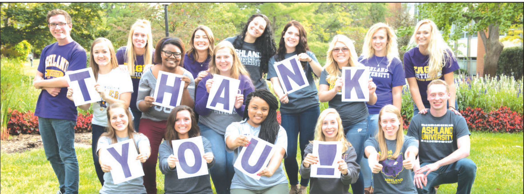
Students showing gratitude for AU donors.