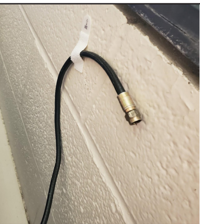
MASON JONES Cable cords are no longer used in the dorms.

The start of the new semester is exciting for every student as there are a lot of new things happening all around campus. New classes, roommates, classmates, dorms, etc. Whether these changes are good or bad, it all depends on how the student handles it, but one change that is on every returning student's mind has to be about the cable being cut in the dorms as well as the ethernet