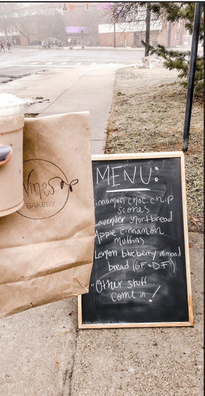
CASS TOLLIVER An iced chai latte and scone to go

Recently we have been blessed with beautiful, fall-like, mid-70s weather in Ashland