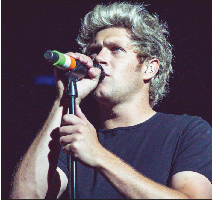
NODERIVS 2.0 GENERIC