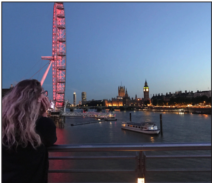
SUBMITTED BY MORGAN BADENHOP