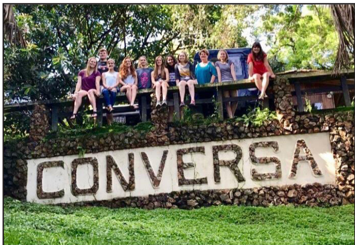
SUBMITTED BY ELISE BUZZA